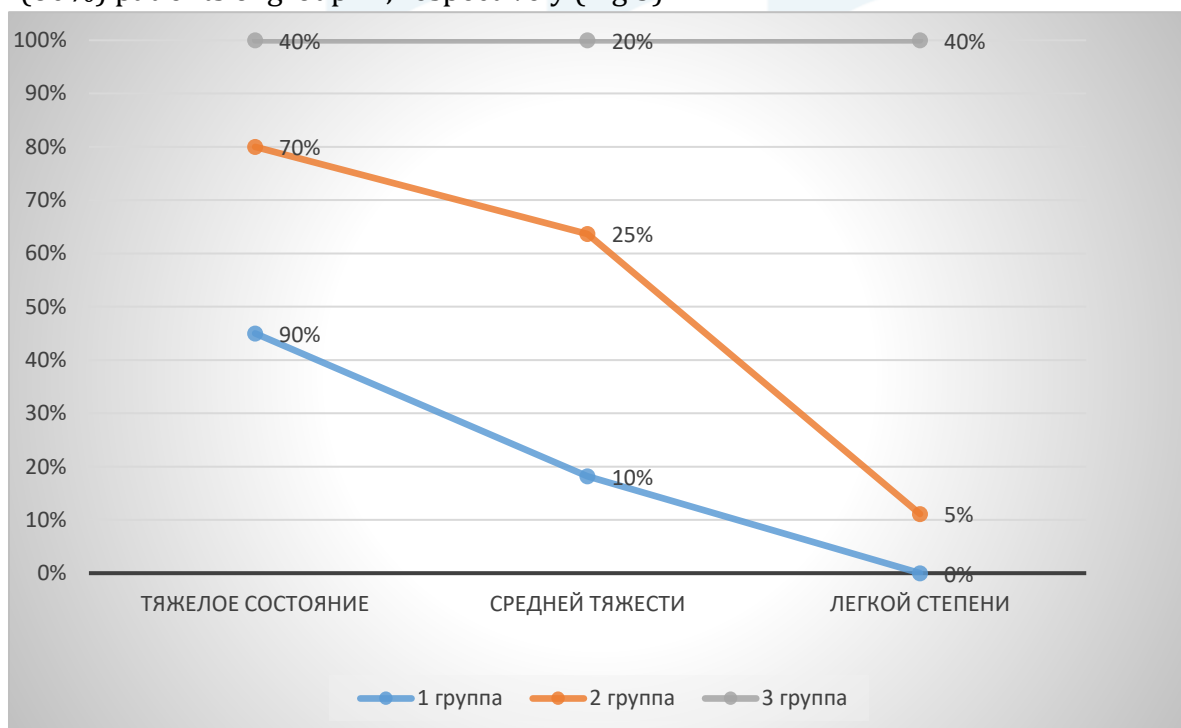
Figure 3. Distribution of newborns in the compared groups according to the severity of the general condition.

The period of early postnatal adaptation was complicated in all children. The condition at birth was assessed as severe in 20 (100%) children of group I, 18 (90%) children of group II, in 12 (60%) patients of group III, respectively (Fig 3).