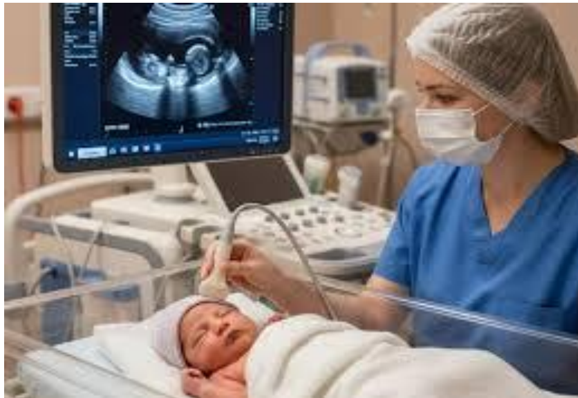
Figure 2. Neurosonography of the brain of a newborn

Dilation of the lateral ventricles in newborns at 1 month was noted less frequently in all observation groups than in the early neonatal period (15%, 10%, and 5%, respectively, in groups 1, 2 and 3). It was also noted that the number of premature newborns in the neonatal period who did not have pathological changes on neurosonography was significantly ( p < 0.05 ) less than in the comparison group, where normal neurosonograms were detected in almost half of the examined newborns, 10% and 15% in groups of premature babies, versus 40% in the group of full-term newborns. Hypoxic-hemorrhagic lesions of the central nervous system (IVH grade I) at the end of the neonatal period were diagnosed in children in 15% and 10% of groups 1 and 2, respectively. 1 full-term newborn from the comparison group also had grade I IVH.