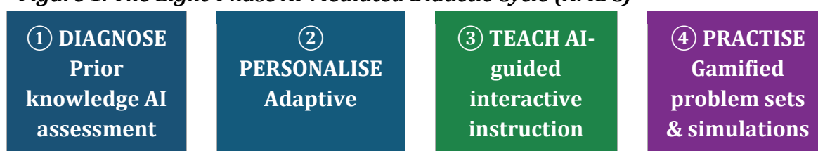
Figure 1. The Eight-Phase AI-Mediated Didactic Cycle (AMDC)

Based on the theoretical synthesis and empirical observations, the authors developed an eight-phase instructional cycle — the AI-Mediated Didactic Cycle (AMDC) — that operationalises the didactic principles above within an AI-enhanced environment. Figure 1 illustrates the cycle diagrammatically.