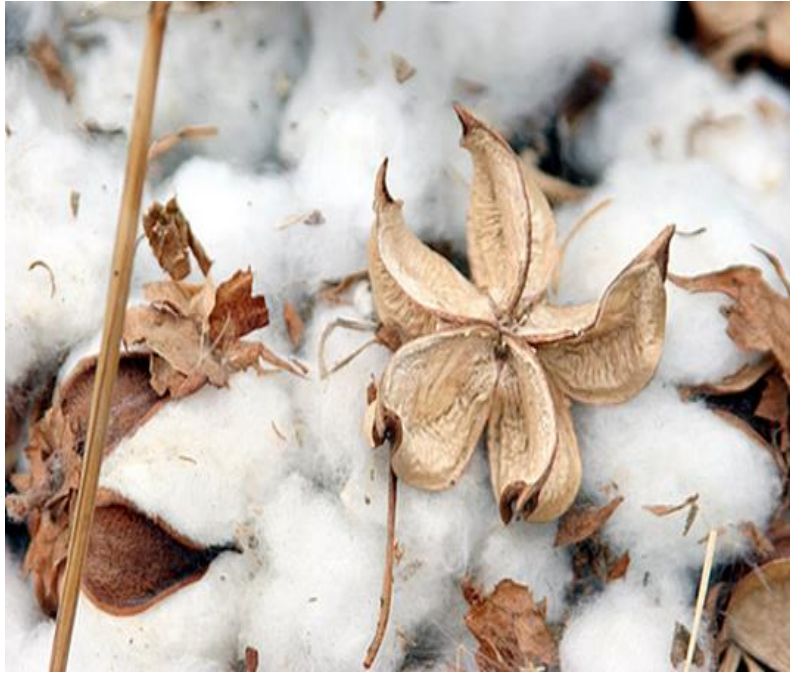
Fig.1. Example of crude cotton

Process of cotton cleaning is performed using several units of equipment. Cotton cleaning process is based on mechanical treatment of cotton and aerodynamic cleaning using air blow. Recently, for equipment improvement to reduce mechanical damage on cotton fiber and increase efficiency of cleaning process, there are performed a lot of research for cotton treatment improvement. Direction of technology improvement is pointed to decrease of steps of mechanical treatment and increase of one machine efficiency, thus reduces mechanical damage of cotton fibers and seeds, such treatment makes process more efficient. It gives chance to think that, variable influences of forces on cotton reduces occurrence of mechanical defects. Following this paradigm, technology modification is made by replacing two machines of mechanical cleaning by one vibrating crate, which perform planar movement, ensuring jump of cotton wisp from crate surface and bump from gravity and inertia forces back to crate surface. Crate moves in horizontal and vertical planes thus ensuring proper movement of cotton wisp and ensuring efficient cotton cleaning process without mechanical smashing through metal grill.