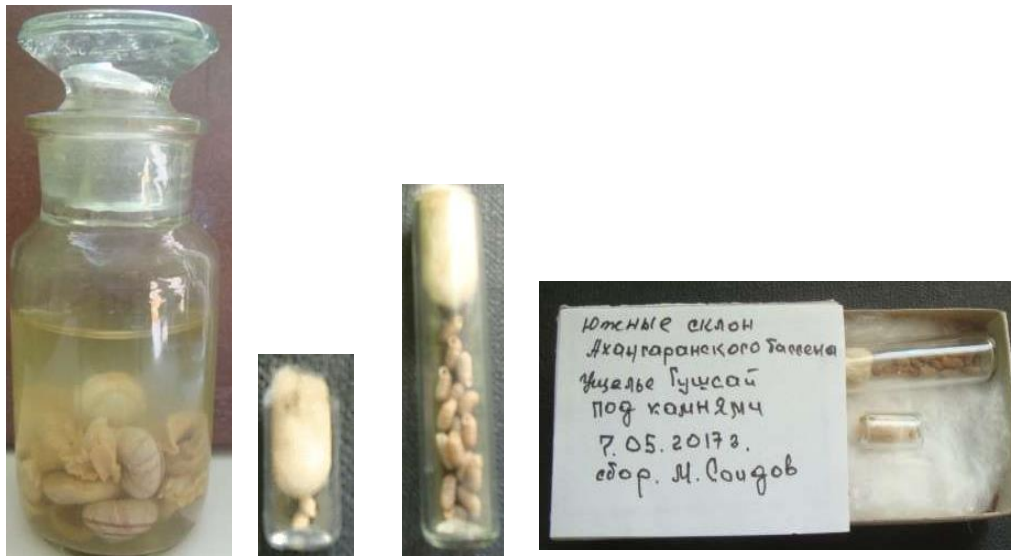
Rice. 1.1. Fixation and storage of mollusks: A-in a jar; B, B-c test tube; G- in a matchbox.