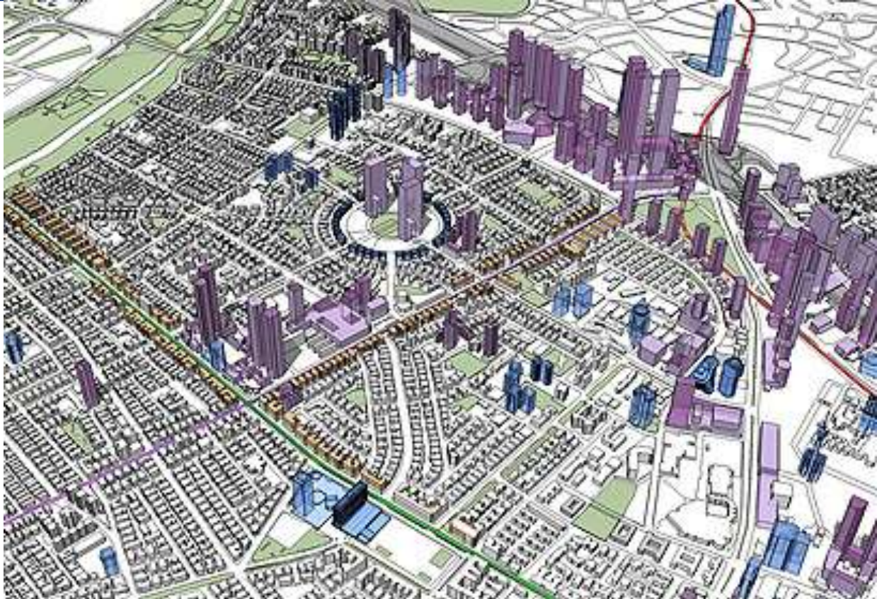
The general plan of the city of Samarkand 2020.

Compositional diversity is manifested in the use of buildings of different sizes, heights, and styles. Historical ensembles, as a rule, were formed for a long time, rebuilt as needed. As historical experience shows, the use of different architectural styles can not only not destroy the integrity of urban complexes, but also compositionally enrich them with a variety of architectural forms.