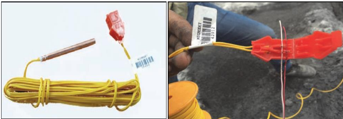
Picture1. 521 detonators were detonated during the first blasting operations at the Tebin Bulak mine.