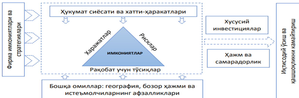
Figure 1 . Investment environment and its organizational elements 9

Investment environment is this of firms efficient investment input , work seats Create and expand possibilities and encouraging factors sure defines places is a set 8. In this the government policy and actions , costs , risks and competition barriers such factors have a strong influence. ( Fig . 1 )