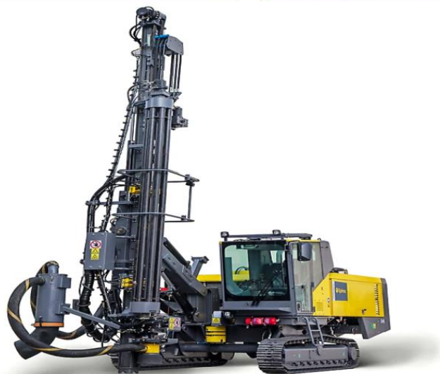
Figure 3: PowerROC D45