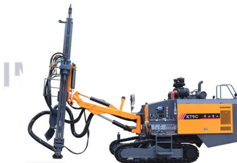
Figure 2: Kaishan KT-9C

The operating parameters of the drilling rigs, the names of the manufacturers and models of which are given above, i.e. drilling depth, diameter, and overall ratio, are selected to be almost the same size as the KAISHAN KT-9C drilling rig in the Tebinbulak mine. The table below provides more detailed information about the advantages and disadvantages of these drilling rigs compared to the current drilling rig.