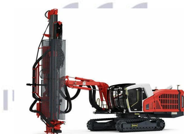
Figure 5: Ranger DX800RT

One of the main advantages of the above-brought FlexiROC as well as PowerROC drilling machines to other types is the presence of a remote control panel provided by the Epiroc company, the employee can control drilling machines of several drilling Epiroc models at the same time [7].