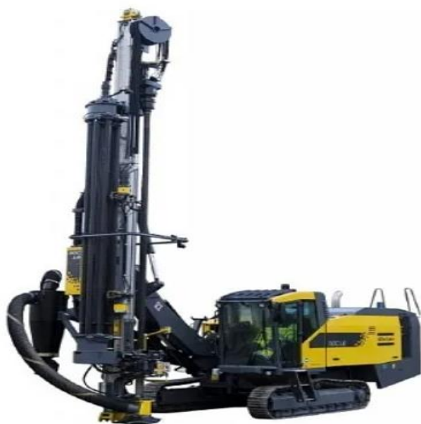
Figure 4: FlexiROC D50