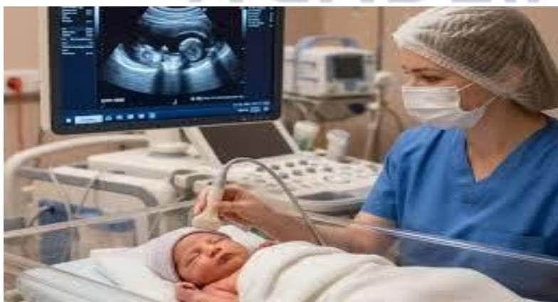
Figure 2. Neurosonography of the brain of a newborn

This indicator of hypoxic-ischemic damage to the central nervous system decreased by almost 2-3 times ( p < 0.01 ) compared with the early neonatal period in all observation groups. Subependymal cysts, according to the ultrasound examination of the brain, in most cases as a consequence of the transferred intraventricular hemorrhage, were recorded only in premature infants 5% and 10%, respectively, in groups 1 and 2 (Fig. 2).